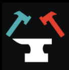
Krypta test map